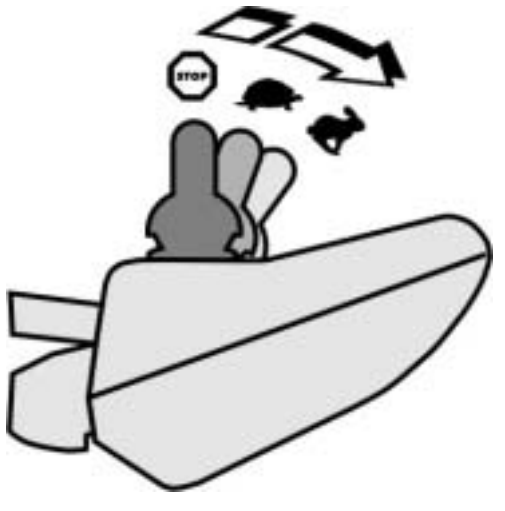
The further the joystick is moved in a particular direction, the more dynamically the wheelchair reacts.